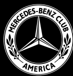
Image in contest promotional materials does not represent actual prize being won.

Open to MBCA Members only. Must be 18 years of age or older. No limit on the number of tickets one member may purchase. 1st place will receive $56,200 less 25% tax-withholdings; 2nd place will receive $44,500 less 25% tax-withholdings; 3rd place will receive $10,500 less 25% tax-withholdings. The 1st and 2nd prize winners will shop for their vehicle at the dealership of their choice. The 3rd prize will receive a check that may be applied towards the registration of a 2020 German trip. If fewer than 4,450 tickets are sold, 1st prize will receive 50% of one-half (50%) of the gross raffle ticket sales; 2nd prize will receive 40% of one-half (50%) of the gross raffle ticket sales; and 3rd prize will receive 10% of one-half (50%) of the gross raffle ticket sales - less Federal withholding of 25%, or at least $5,000 (less withholding), whichever is greater. Vehicles featured in this ad are representative only. Odds of winning depend on the total number of tickets sold. Must be a current Member of MBCA at the time of purchase and day of the prize drawing. Members may attend the drawing (not required to enter or win). 100% of net raffle proceeds shall be devoted exclusively to the lawful purpose of MBCA International Status Section.