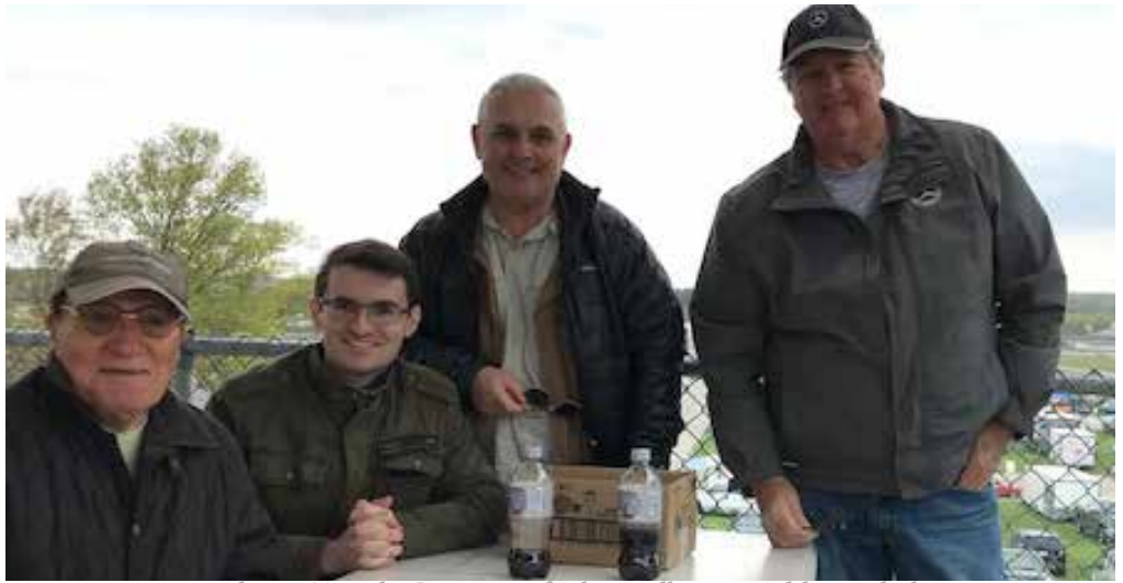
Photos/Article Courtesy of John Ledbury - Additional photos on page 13

Kicking off the Road America schedule, the festival had races featuring cars from several decades. Also, there were many interesting cars at the track to view: both race cars and customer cars.